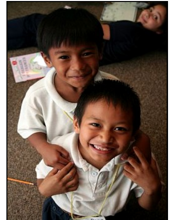
Students at Heart House Dallas

We grew our membership to 38 afterschool providers, offered 53 different training experiences and released our Afterschool Quality Advancement program, containing best practices, resources and self-assessment tools. We also continued the push to raise awareness for the importance of out-of-school time.