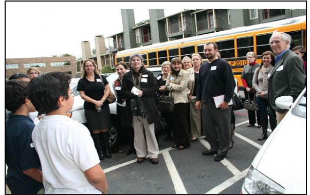
Guests on Lights On Afterschool bus tours

Lights on Afterschool (LOA) is a nationwide initiative of the Afterschool Alliance. Communities and afterschool providers plan celebrations across the nation to raise awareness of the importance of afterschool for America's children, parents and communities. Dallas AfterSchool Network collaborated with our member providers to celebrate Lights On Afterschool by hosting two bus tours, one in North Dallas and the other in South Dallas. We were joined by 160 community volunteers, elected officials, business leaders, foundation staff, college students and donors. Participants visited three afterschool sites, including apartment, school, and community center based programs.