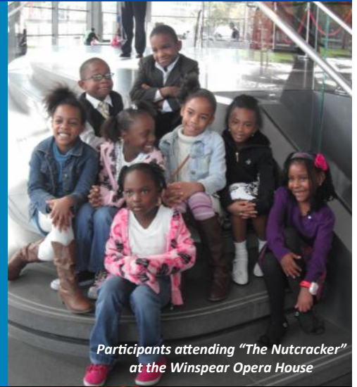
Participants attending "The Nutcracker" at the Winspear Opera House