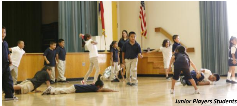
Junior Players Students