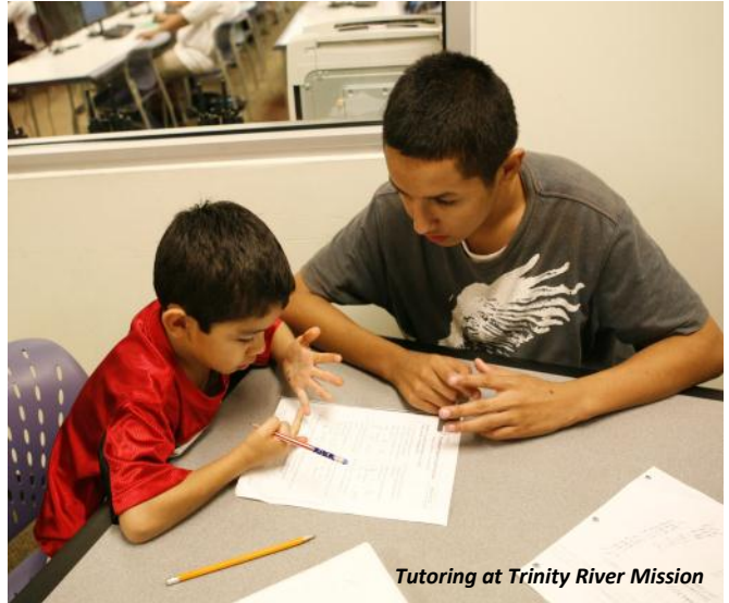
Tutoring at Trinity River Mission